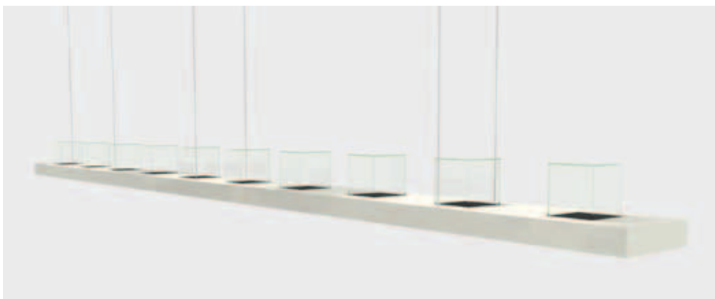
Special cube 18.8 x 18.8 x 18.4 cm used for the 20 participants design