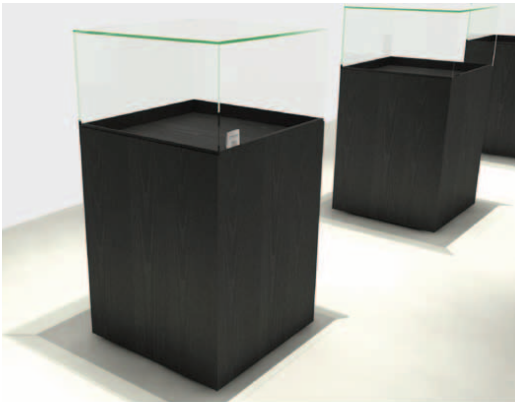
Display case 56.8 x 55.2 x 34.4 cm